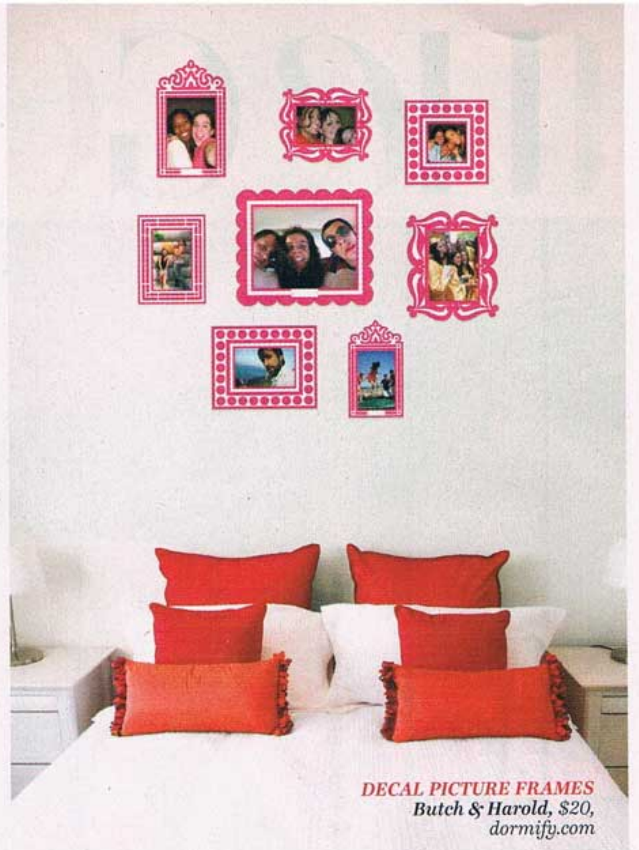
DECAL PICTURE FRAMES Butch & Harold, $20, dormify.com