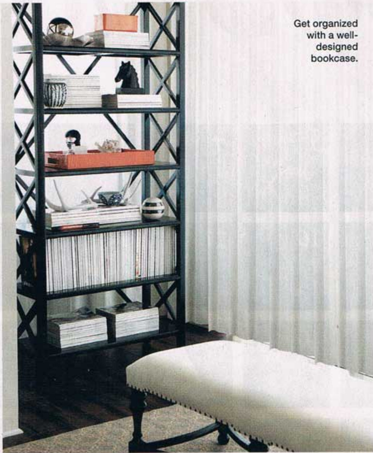
Get organized with a well-designed bookcase.