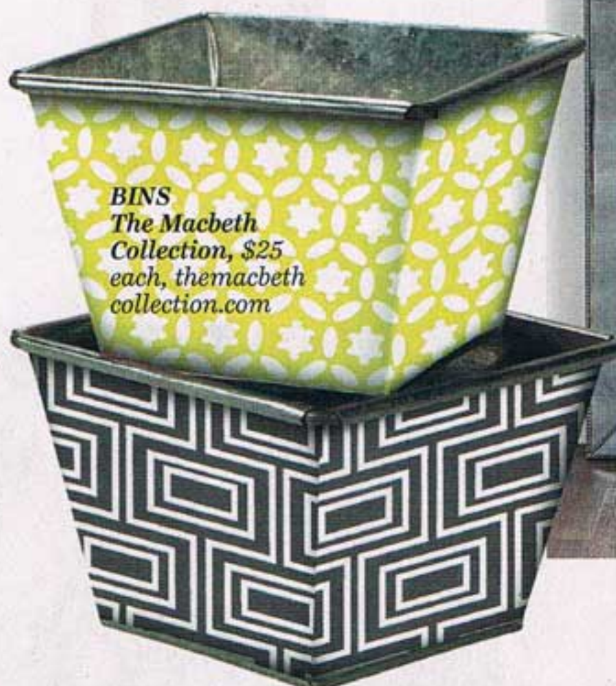
BINS The Macbeth Collection, $25 each, themacbethcollection.com

Keeping things tidy is a big challenge for many, but it helps with productivity. If you are using a spare bedroom as a home office, convert the closet into storage central. Closet-organizing systems are available in different wood finishes and