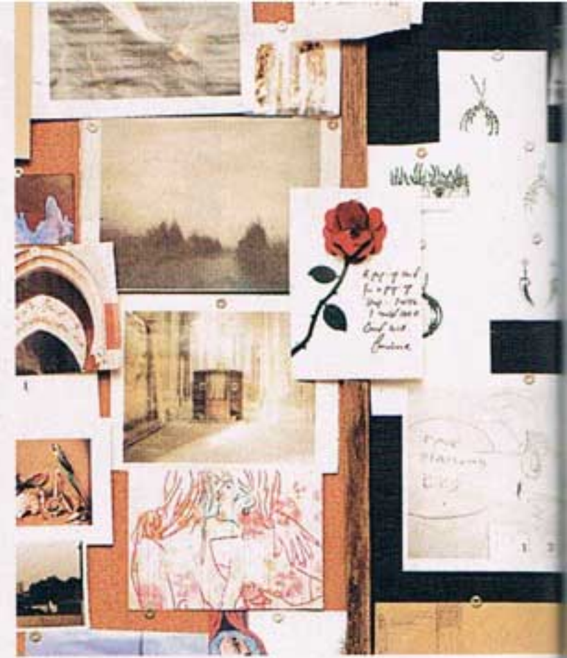
Pin up inspiration on a corkboard.

design trend and we're seeing it in artwork, pillows and furniture.