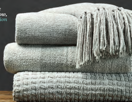
Silver Sage Chenille Throw, $79, Restoration Hardware