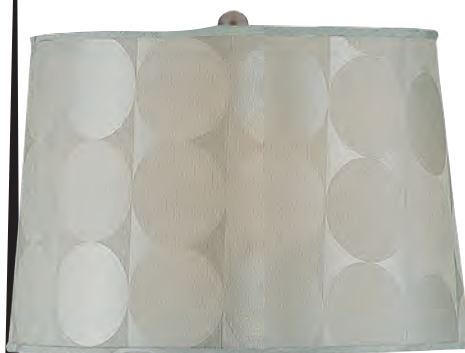
Cosimo Table Lamp in Silverstone, $240, available only at target.com