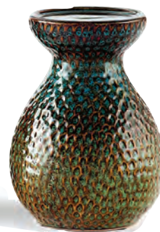
Trendsetter Candle Holders (set of two), $48, celebratinghome.com

TIP: Lighting is another element to consider. For a touch of glitz, you can install a beautiful chandelier or a dimmer switch to control the intensity of the light. And for visual symmetry, place a lamp on each of the nightstands, framing the bed. Just remember to keep the size of the lamp in proportion to the size of the nightstand.