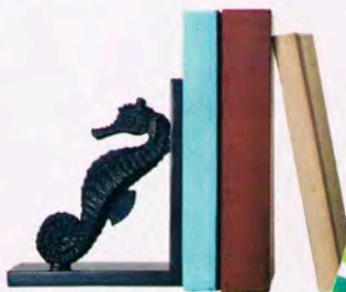
SEAHORSE BOOKEND , Target, $10, target.com PILLOW , Crate & Barrel, $35, crateandbarrel.com

Avoid taking a literal approach to beach-inspired décor: Forgo anything embellished with images of seashells, seagulls or palm trees. Instead, capture subtle reminders of the coast by using the colors of the sea, sky and sand. To give a room added contrast and depth, pair different shades of blue with complementary tones, like a grassy green or sunny yellow. You can instantly refresh a space by painting an accent wall turquoise or navy blue. These darker hues have a nautical feel and work beautifully with white trim and molding to create a modern aesthetic.