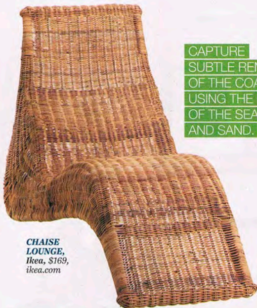
CHAISE LOUNGE , Ikea, $169, ikea.com

In the bedroom, replace your bulky comforter with a lightweight coverlet or quilt and breathable cotton sheets that'll keep you cool during the hotter months. To really change things up, keep your decorative bedding (coverlet, shams and bedskirt) all white and buy bright sheets that'll enliven the room every time you make the bed. It's clean and simple with a pop of color.