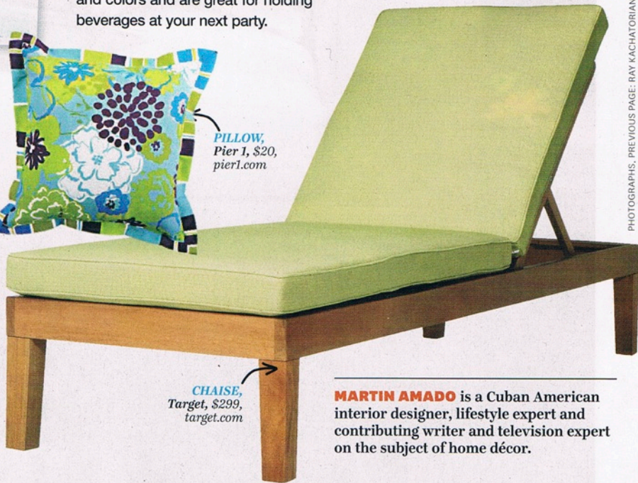
CHAISE, Target , $299, target.com