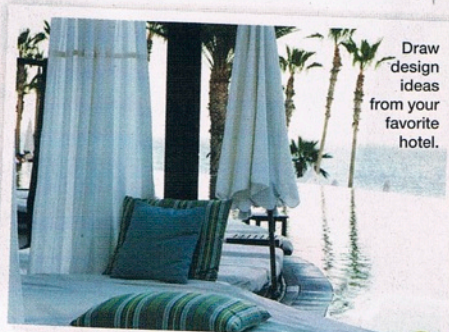
Draw design ideas from your favorite hotel.

Even if you don't have a green thumb, it's nice to add flowers or other greenery to help soften the look of concrete or tile floors. Plant them in colorful pots and group in clusters for more impact. You can also repurpose a metal plant container as a cooler. They come in many sizes and colors and are great for holding beverages at your next party.