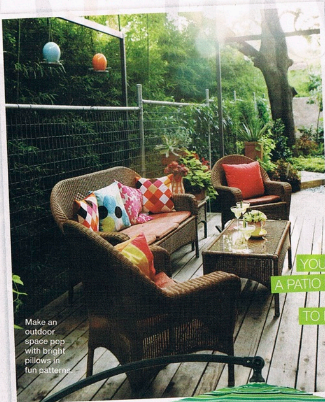
Make an outdoor space pop with bright pillows in fun patterns.