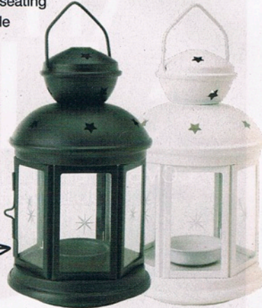
LANTERNS, IKEA, $4 each, ikea-usa.com

GET MORE BANG FOR YOUR BUCK BY PURCHASING A PATIO SET AND SEPARATING SOME OF THE PIECES TO DECORATE MORE THAN ONE AREA.