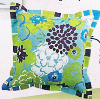
PILLOW, Pier 1 , $20, pier1.com